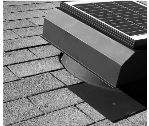
Fig. 5 - Installing the Attic Vent

Step 10 - Installing the Attic Vent: Using the roofing knife, cut a 4 inch gap in the shingles and tar paper at the 3 o'clock and 9 o'clock positions of the attic hole to allow the attic vent flashing to slide underneath. Position the attic vent unit so that it is horizontally centered with the attic hole. Slide the square flashing of the attic vent unit, underneath the shingles and tar paper, into the gap that was cut at the 3 o'clock and 9 o'clock positions of the hole. Lift the unit up at an angle while still in position. Using the caulking gun, run a bead of caulk on the bottom side of the flashing facing the roof. When finished, continue sliding the unit upward and underneath the shingles until it is positioned directly over the attic hole. The cylindrical part of the attic vent should be touching the cut out edge of the shingles when the unit is aligned directly above the hole (see Fig. 5).